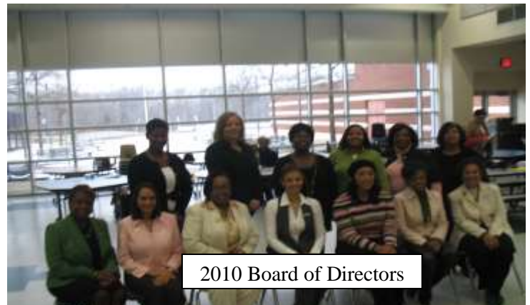
2010 Board of Directors