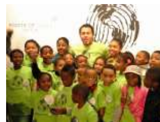
Charities had the unique privilege to take 50 elementary-aged children to the Points of Light Foundation's Celebration of A Day of Service 2010 featuring Corbin Bleu in Washington, DC.