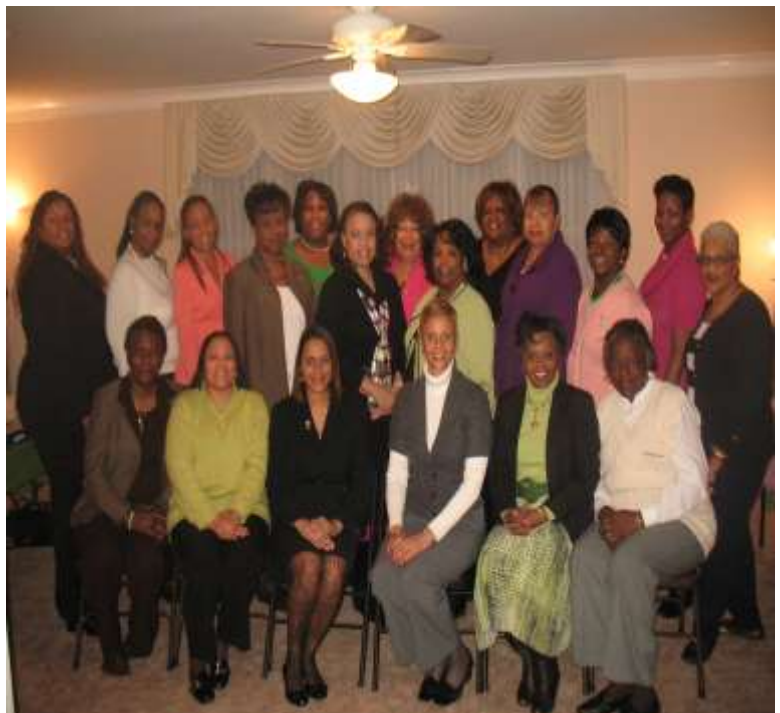
The Ivy Community Charities of Prince George's County, Inc. 2012 Board of Directors and Corporate Staff at The Ivy Youth and Family Center